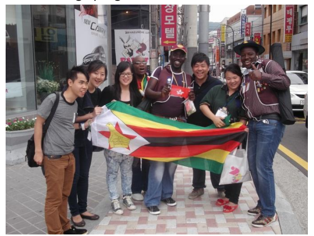
Leo club of Hong Kong

1830-2000 International show; this was a platform for social networking with Leos from other Districts and notably, we made links with Leos from Germany with whom we are cultivating healthy twinning and exchange programmes.