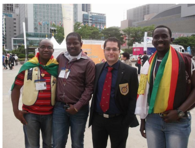
Leo President of Hamburg Omega Leos of Germany